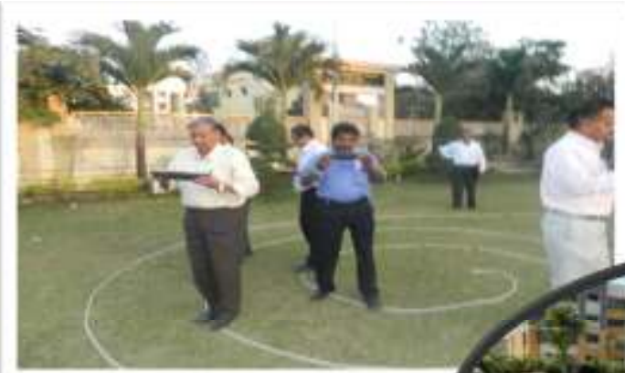
Walk on Rope