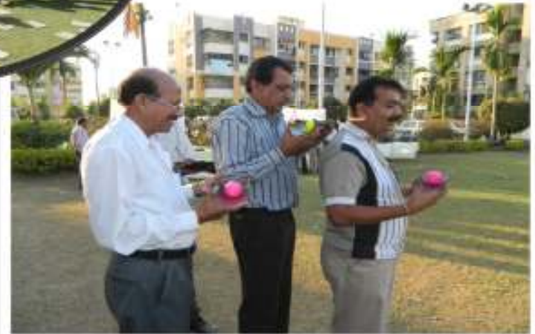
Separate the Mixture