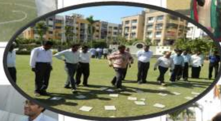
Acid river Crossing